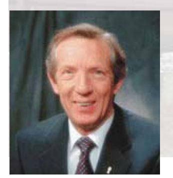
Lorne Calvert, Premier of Saskatchewan

The GDI Board of Governors remains informed, provides general over-all direction for the evaluation, and approves the evaluation framework prior to proceeding. The Department, in conjunction with the Board of the GDI, will determine follow-up to the review. Together, they will derive recommendations from the review's conclusions, and identify future directions or actions and implications in the findings. It is anticipated that the evaluation process will take approximately 18 months.