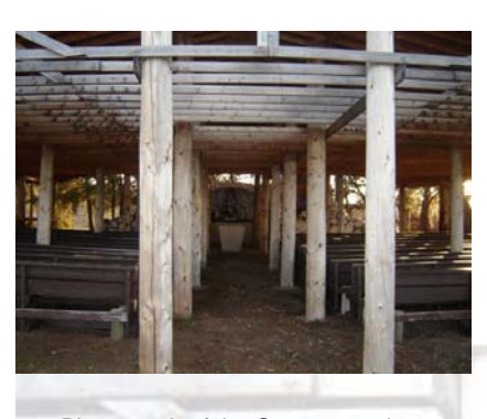
Photograph of the Grotto near the beach in Ile a la Crosse

GDI is currently in a five year contract (December 1, 2003 – November 30, 2008) with the Province for the provision of educational, research, and resource services to Métis people in Saskatchewan. This contract is the first longer-term contract that the Institute has held with the province - former contracts having been on a year-to-year basis. One of the stipulations of this contract calls for evaluation of GDI activities funded by provincial grants. As such, the Institute has established an Evaluation Working Group. An equal number of representatives from both the Institute and the Department of Advanced Education and Employment (AEE) sit on the Working Group. AEE in partnership with GDI is undertaking this evaluation to assess the effectiveness and impacts